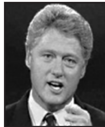
Bill Clinton says he is out to save the world.

The (diminutive) pro-trade wing of the party at Will Marshall's Progressive Policy Institute argues that high U.S. tariffs on clothing and shoes constitute a burdensome tax upon poorer American consumers. The PPI has issued a stream of well-documented studies that explain how the modern tariff system is