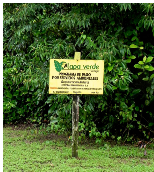
FIGURE 2. A Payment for Environmental Services program in Costa Rica supports 90.4 ha of natural regeneration.

Large-scale natural restoration programs can also inform FLR initiatives by highlighting the factors and policies that regulate human behavior and that cause the transitions from deforestation to reforestation (Adams et al. 2016). Although FLR has clear benefits for climate mitigation at the global scale (Stanturf et al. 2015, Chazdon et al. 2016) and for production of goods and services at the landscape scale (Stanturf et al. 2012, Locatelli et al. 2015), the impact of FLR on local livelihoods is poorly understood (Aronson et al. 2010, Le et al. 2012, Adams et al.