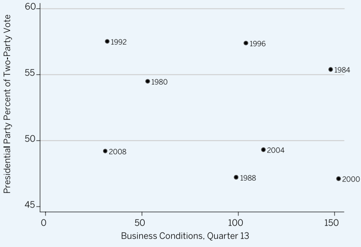
Figure 2 Predicting Presidential Preferences in Trial-Heat Polls in Early April from Quarter 13 Perceived Business Conditions, 1980–2008

Quarter 13 is the first quarter of the election year. Trial-heat results are based on trial heats of the eventual candidates averaged for days 200 to 215 before Election Day. The business conditions question was: "Would you say that at the present time business conditions are better or worse than they were a year ago?" The scale is (percent better – percent worse) + 100.