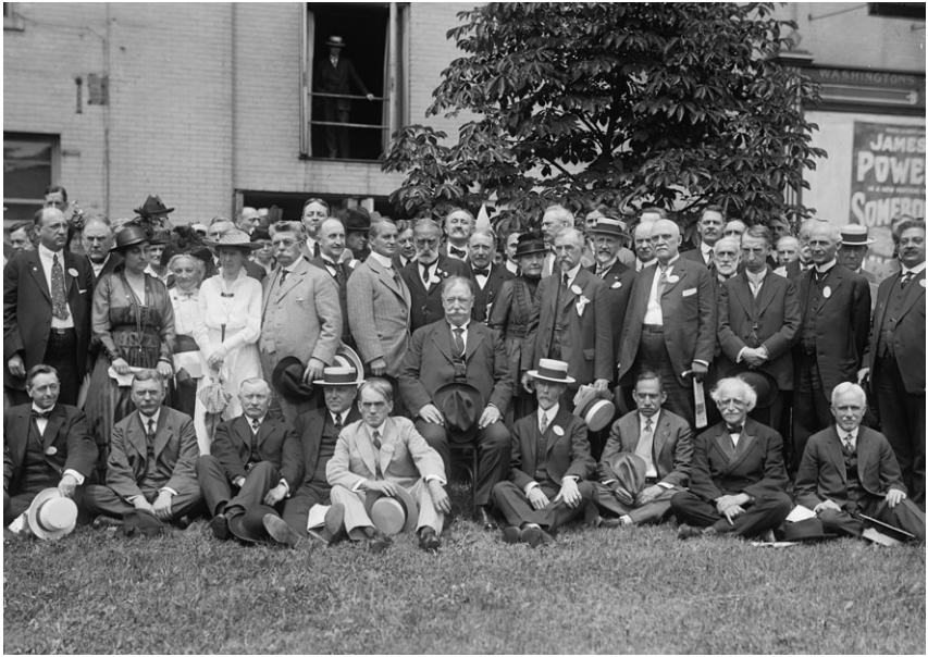
Figure 3: The staff of the League to Enforce Peace surrounding the organization's president, William H. Taft, in 1916. LC-DIG-hec-03413.

military sanctions to any member that went to war without first submitting its dispute to the court or the council. 22