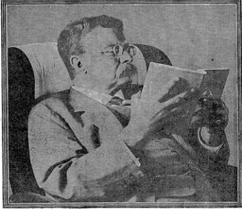
In the same way our action in Santo Domingo, when we took and administered her Customs Houses, represented a substantial and efficient achievement in the cause of international peace which stands high in the intention of applying them with the sweeping universality we promised. In those cases we were usually, although not always, right in our refusal to apply the treaties, or rather the prin-

Sincere lovers of peace who are wise have been obliged to face the fact that it is often a very complicated thing to secure peace without the sacrifice of righteousness. Furthermore, they have been obliged to face the fact that generally the only way to sa-