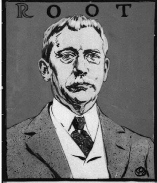
Figure 5: A watercolor portrait of Elihu Root painted by the famed illustrator Edward Penfield and published as the cover of Collier's magazine on November 13, 1915. Courtesy of Library of Congress, Prints and Photographs Division, LC-USZC4-2921.

League forces against those who wanted to weaken and delay the League. Most contentious was Article X, which enjoined member states to preserve the independence and territorial integrity of all members against external aggression. Lodge and his followers sought first to dilute the article and then to strike it altogether.