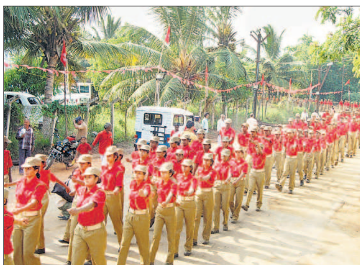
ONCE BITTEN, TWICE SHY: The CPM document says that Left-UPA coordination committee became a trap for the party

Calling Congress a secular bourgeois party that vacillates when the communal forces are on offensive, CPM said its ultimate target is to build up a third alternative of non-Congress secular parties. It also