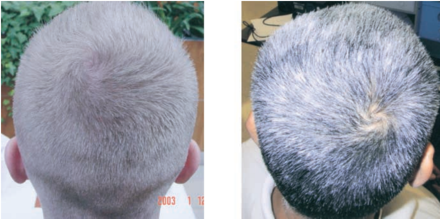
FIGURE 1.—Hair whorls. The counter-clockwise parietal scalp hair-whorl on the left is of a NRH person, and the one on the right of the RH author swirls clockwise.

R/R or R/r genotype) and second, their random distribution with respect to each other and in relation to the left vs. right side of the body in NRH ( r/r ) individuals. By this logic, other similar predictions of the model can be economically tested using a noninvasive and definitive method by simply examining the rotation of hair whorls on the scalp if the NRH individuals develop coiling. Direction of coiling is an easy phenotype to score: Figure 1 shows clockwise and counterclockwise examples of hair whorls.