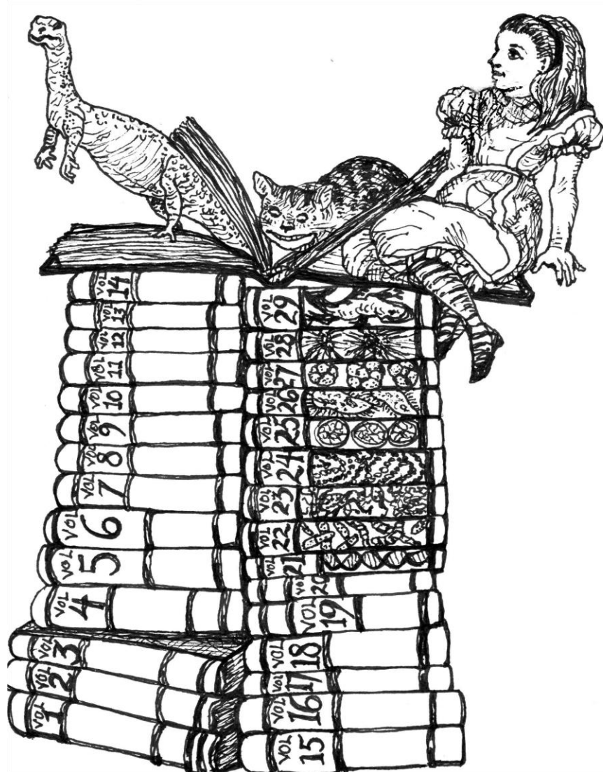
Figure 1 (Amy Pollack, 2007)