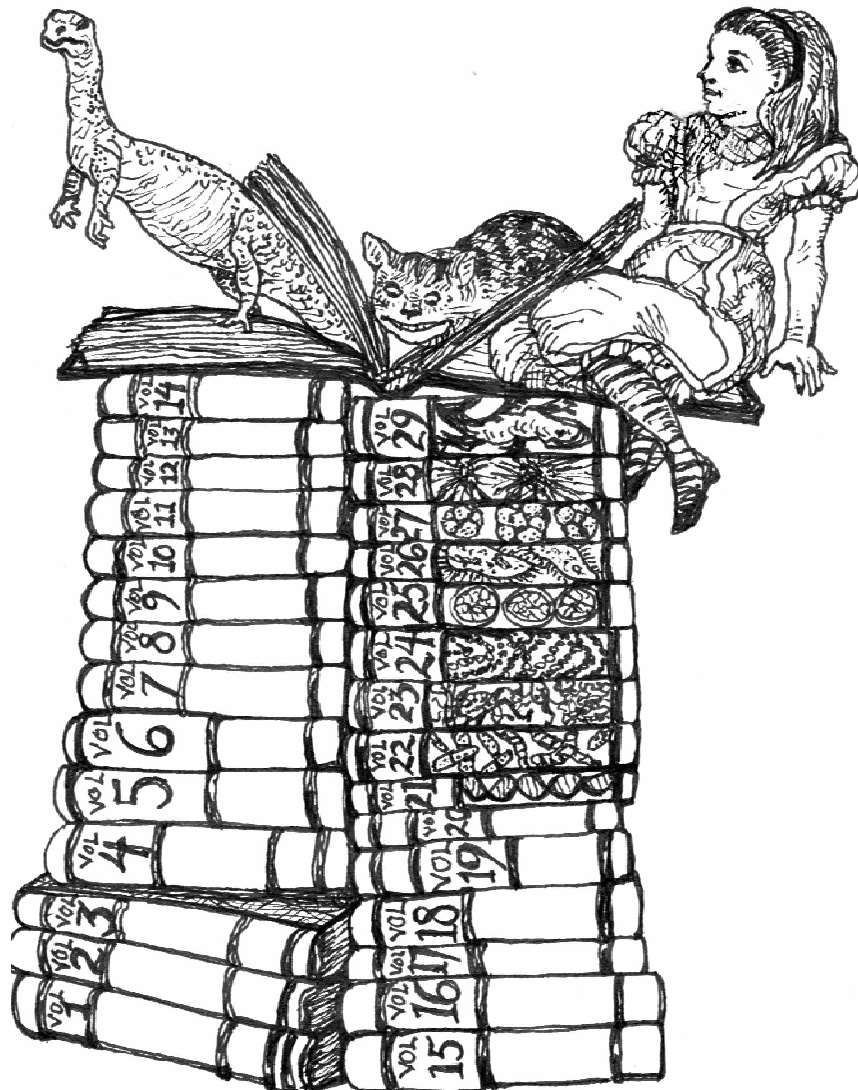
Figure 1 (Amy Pollack, 2007)