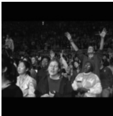
People Worshiping God at Urbana 2000

Interestingly, yet not by coincidence, the God who led the conference to focus strongly on racial reconciliation is doing just the same in the CCC fellowship on this campus.