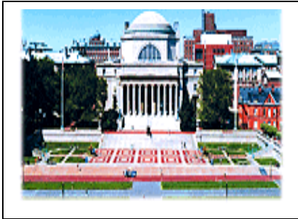
treasures in our possession

tional, unadulterated love. We were meant to be worshipful beings, whether one believes in creation or not Admiring that one guy or girl, cheering for our favorite athletes, praising our friends who have achieved success, cherishing the