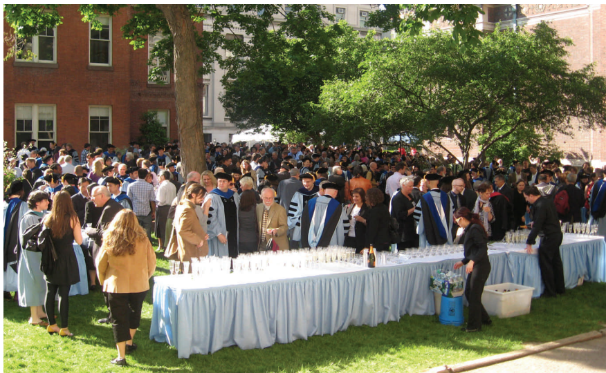
Graduate Reception, May 2009, Front Lawn outside Philosophy Hall