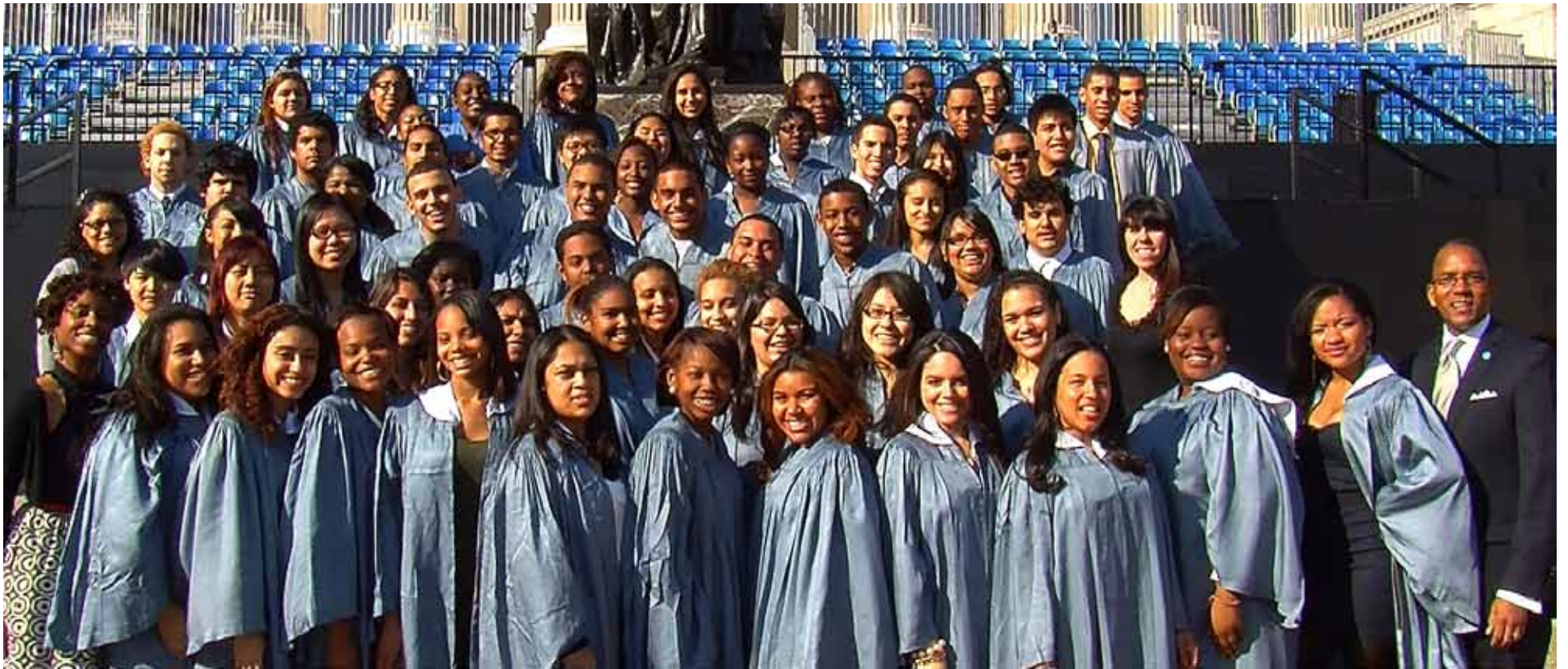
The 2011 class of Columbia University's Double Discovery Center celebrates its graduation.