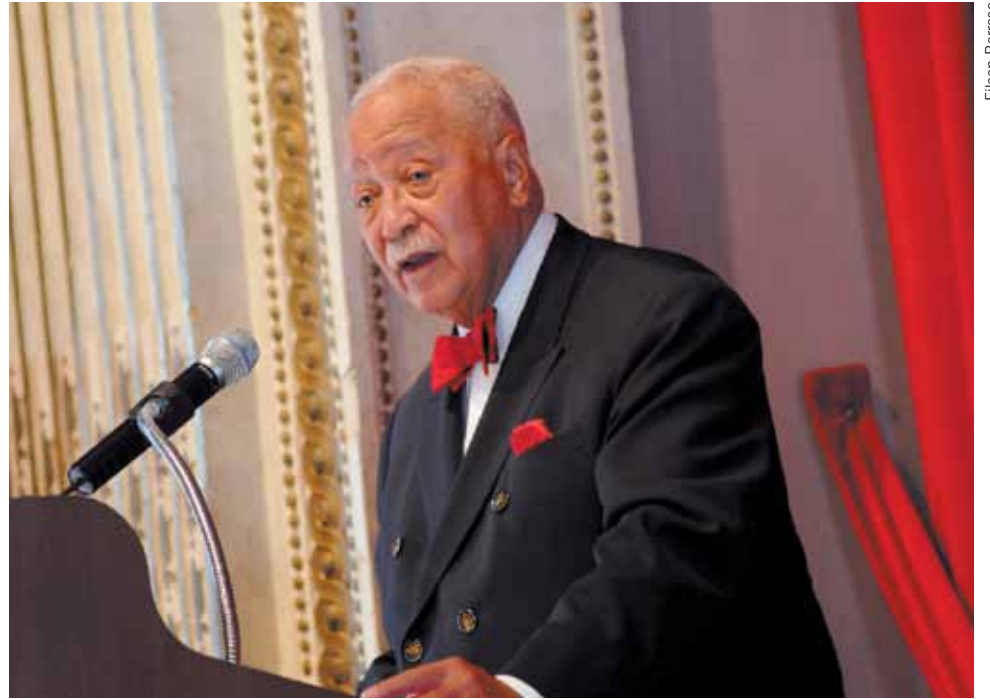
Former New York City mayor David N. Dinkins

As the economy has improved, revenues have begun to rise. But Paterson warned that any progress could be jeopardized by cuts in Washington. He noted that European