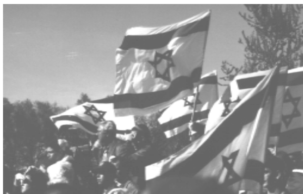
New Jew from page 5

So where to? In a sense, I have made no more a persuasive argument for either side in this paper than before I started. For that matter, I may have convoluted my own emotions dramatically by committing them to paper. For every argument, there seems to be a counter-argument; for every Biblical passage a Talmudic one; for every spiritual explanation a rational one; for every compelling attraction a painful and dismal repellent. Israel as the focus of our religious existence I believe is undeniable. In ways previously unanticipated Israel now forces Jews everywhere to realign their priorities and their modes of self-definition, now requiring the placement of the state at the heart of every debate and emotion. The questions have not changed, though the circumstances have. And the weight of the obligations, temptations, and benefits of the Right of Return, both the one built in over centuries and the one still residual of this century's Zionist colonialism, still weigh heavily on my shoulders.