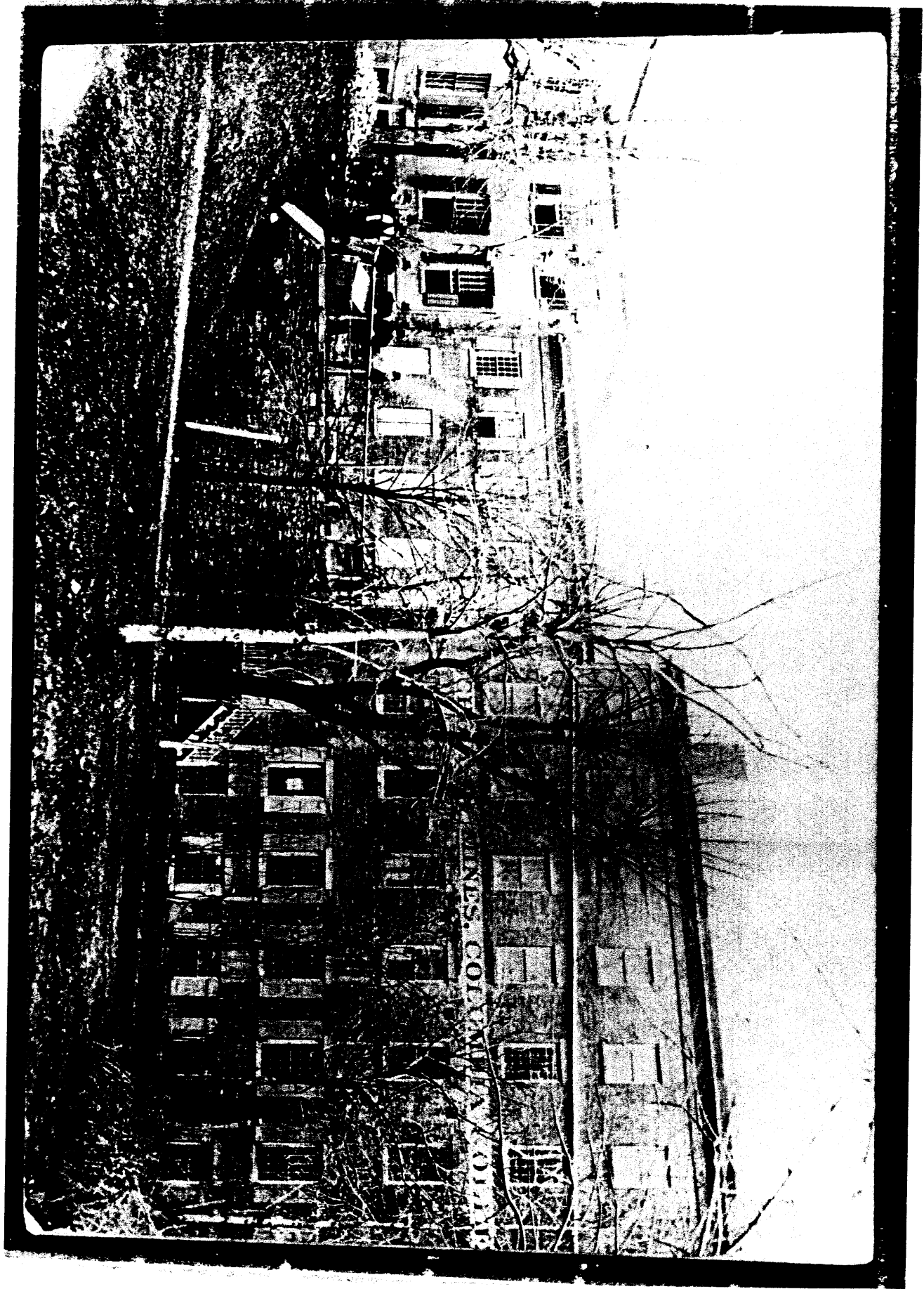
School of Mines , 49 th St. + Madison Ave. Campus