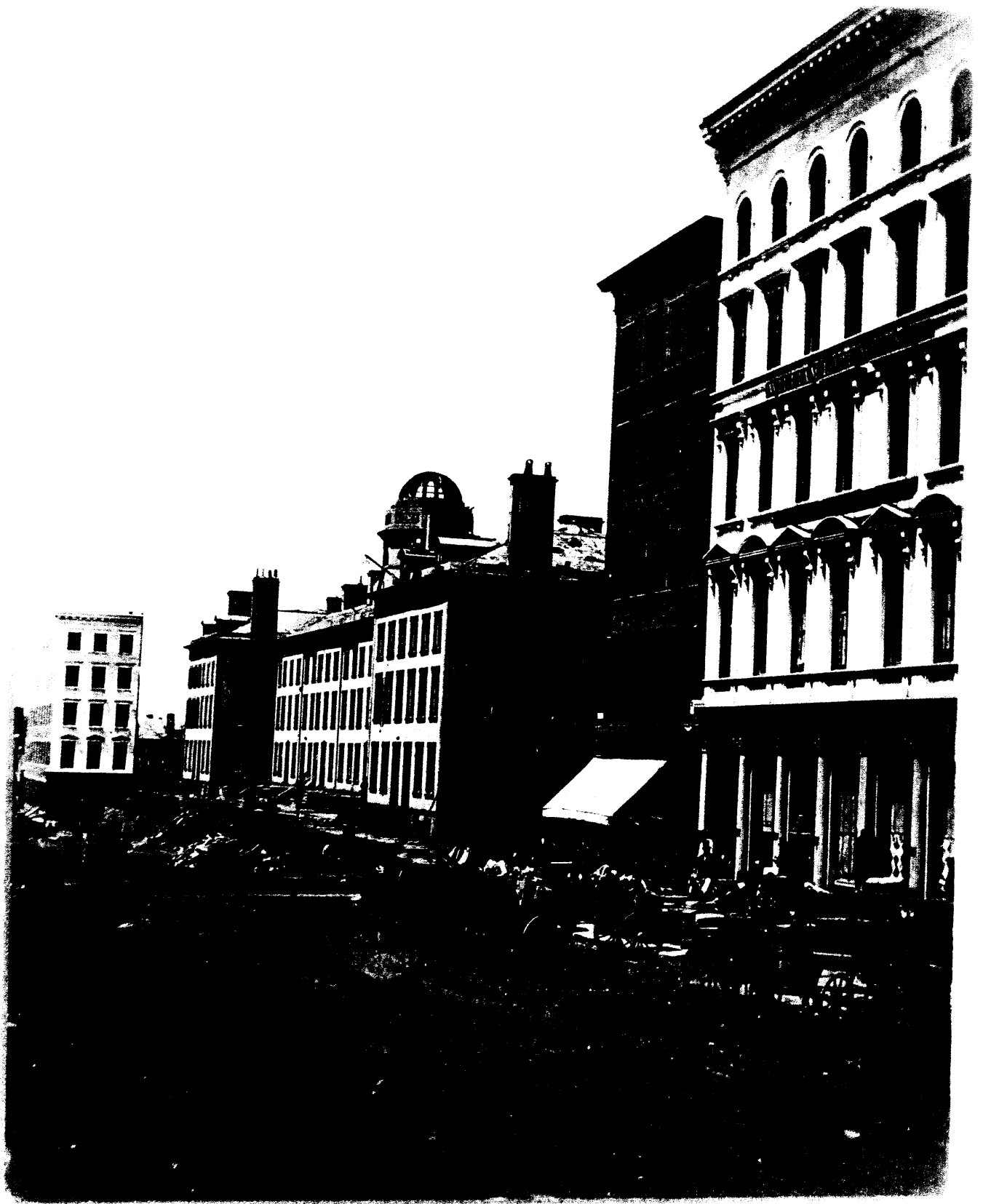
Columbia College Demolition , Park Place, ca 1858