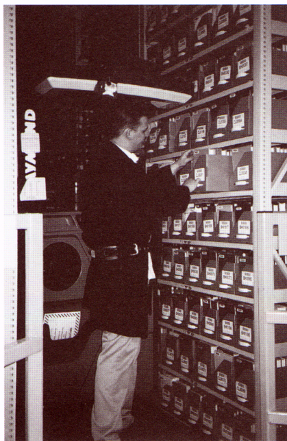
Books and other materials are shelved by size in high density shelving.

FROM THE OFFICE OF THE VP FOR INFORMATION SERVICES AND UNIVERSITY LIBRARIAN AT COLUMBIA UNIVERSITY