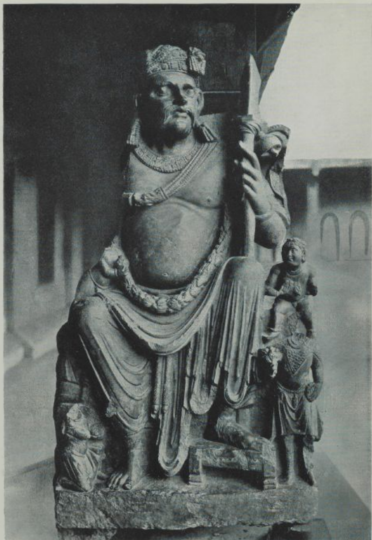
Kuvera. (From an Indo-Greek sculpture)