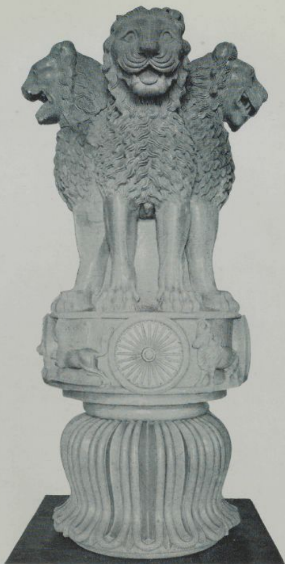
Aśoka Pillar (Indo-Persian)