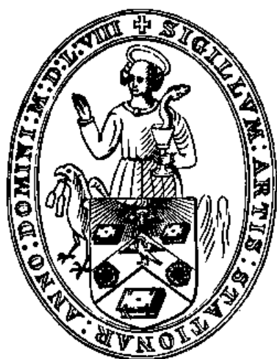
A FACSIMILE OF THE ORIGINAL SEAL OF THE COMPANY, FROM THE TRICKING IN THE COLLEGE OF ARMS, LONDON.