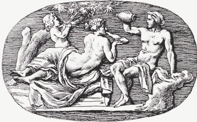
Type of illustration from De Caylus which inspired Josiah Wedgwood.