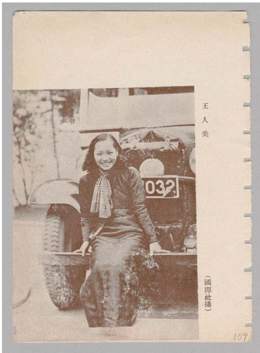
Most photographs of women in Ling long were taken outdoors. Posing with an automobile was a favored stance. Issue 168 (1935), Page 109.