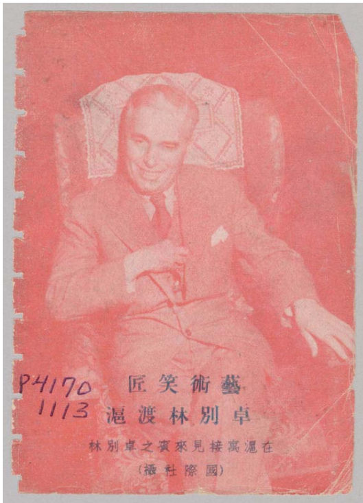
Back cover with a photograph of Charlie Chaplin. Issue includes several photographs of Chaplin's visit to China in the spring of 1936.