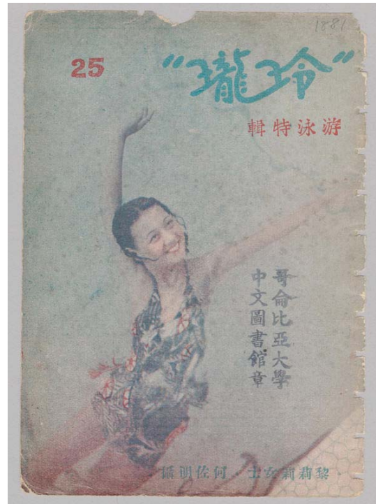
Front cover of a special issue on swimming. Issue 243 (1936), Page 1881.