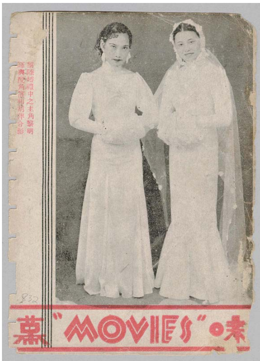
Back cover of Ling long with the title "Movies" and an unusual Chinese transliteration mu wei 慕味 (screen flavor), instead of the common term for movie, dian ying 电影 (electric shadow). Issue 138 (1934), Page 832.