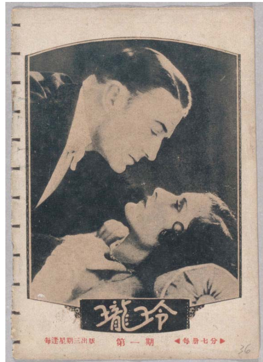
The first back cover of Ling long magazine. Issue 001 (1931), Page 36.