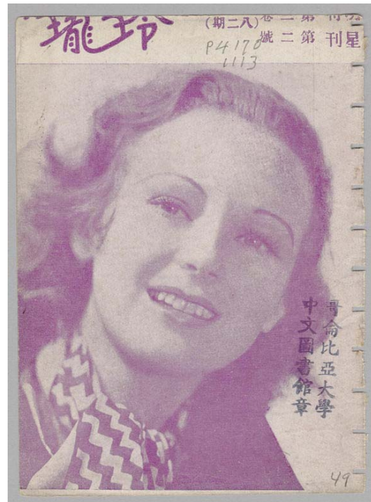
An unusual front cover featuring a non-Chinese woman.