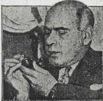
HERBERT H. LEHMAN

"I am leaving within the next day or two on an extended trip. Fortunately, however, I applied some months ago for an absentee ballot so I will be able to cast my vote for you. With all good wishes for your success."