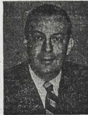
ROBERT F. WAGNER JR.