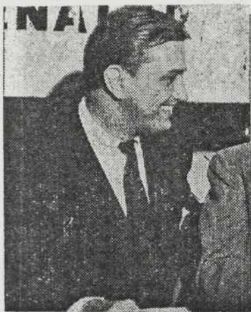
F. D. ROOSEVELT JR.

"Costello is not a power in Tammany Hall. He is not a power behind Tammany Hall. He does not dictate nominations. He does not select Judges. He does not control nor has he any influence over my policies or those of the Democratic Organization in this County in any way, shape or form, directly or indirectly. Since my election as Leader, Costello has never suggested, counselled or requested any program or any choice of candidates."