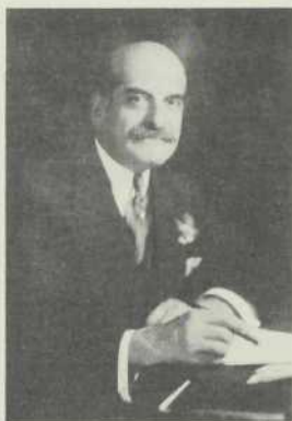
FELIX M. WARBURG

Director of the Seminary and a Founder of the Library