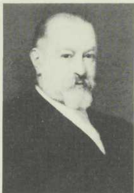
JACOB H. SCHIFF