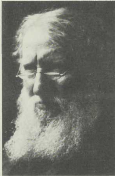
SOLOMON SCHECHTER President of the Seminary 1902-1915