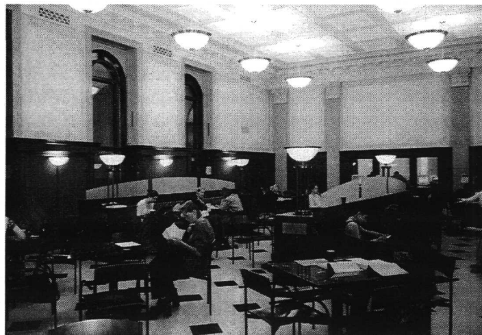
The new lounge is already a popular place to relax, drink coffee, and use e-mail.