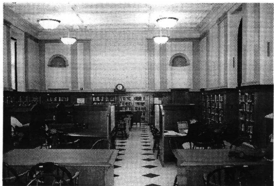
Reading Room 202.

Collection. Adjacent to Room 209, Reserves has a beautifully refurbished space of its own, complete with improved computerized catalog access. Together with the Lounge and Computer Lab, these reading rooms comprise the newly expanded 24-hour Butler study space.