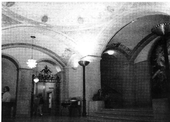
Refurbished main lobby.