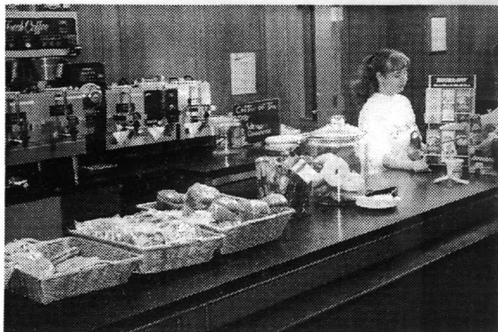
Café Cappuccino offers a varied bill of fare.