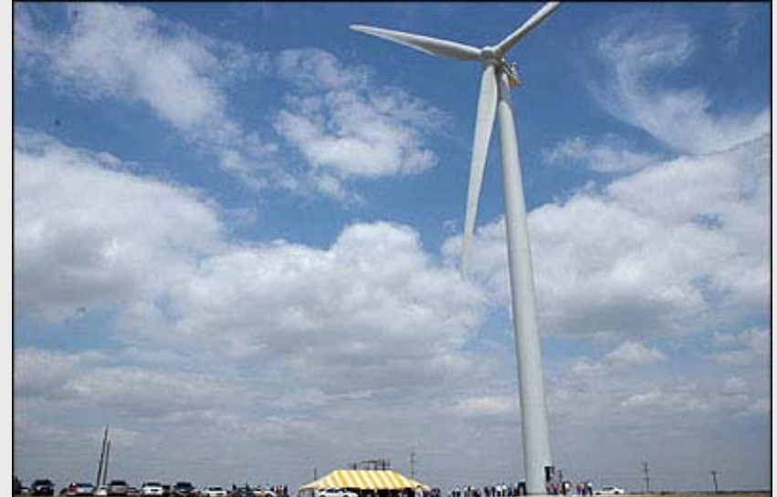
Above: IL Rural Co-op Wind Turbine

– IL Clean Energy Community Foundation (Alliance Member Fund)