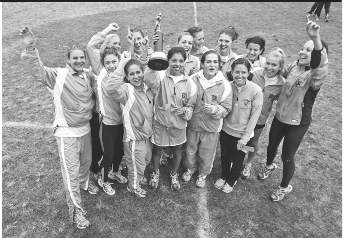
Above: Women's cross country, three-time defending Ivy League champion