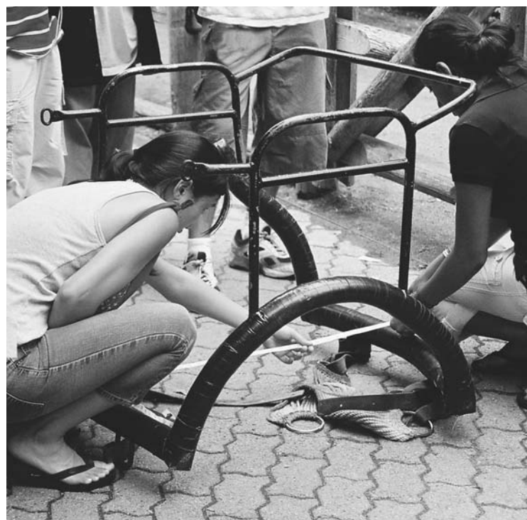
Above left: The camel team sketches a new design for the camel ride based on their observations. Managers from the Wildlife Conservation Society, whose headquarters are at the Bronx Zoo, reviewed students' recommendations.

Below: A zoo-goer begins a lap around the camel track in the saddle currently in use at the Bronx Zoo. As part of their project, students designed 18 ways that various rides, exhibits and park furniture could be made accessible for visitors with disabilities.