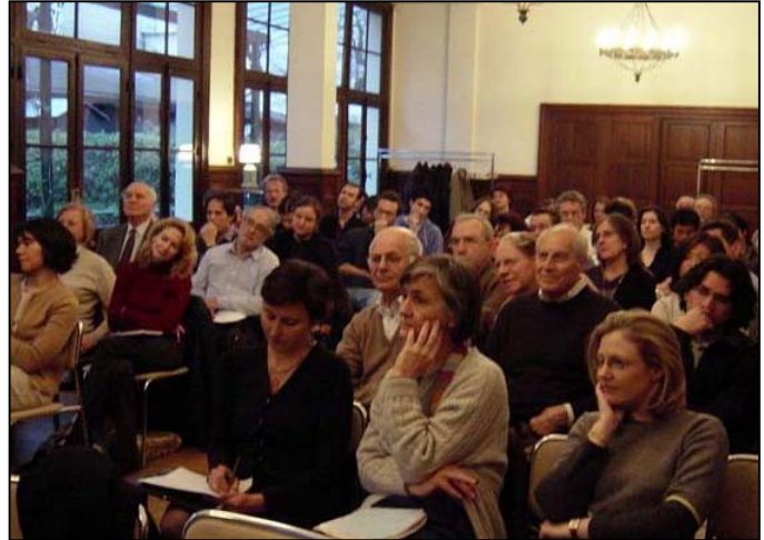
Audience members listen with rapt attention to descriptions of the long genealogy and varied dimensions of French anti-Americanism.