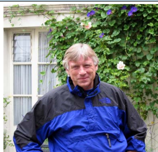
Columbia University President Lee C. Bollinger at Reid Hall on June 26 for the "fun run" with Columbia Alumni in Paris.