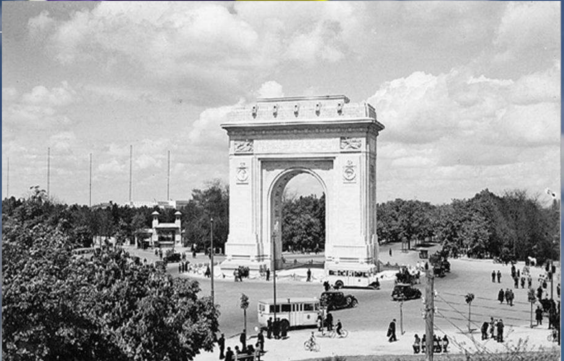
Tony Romani, Slide 7 April 20, 2008