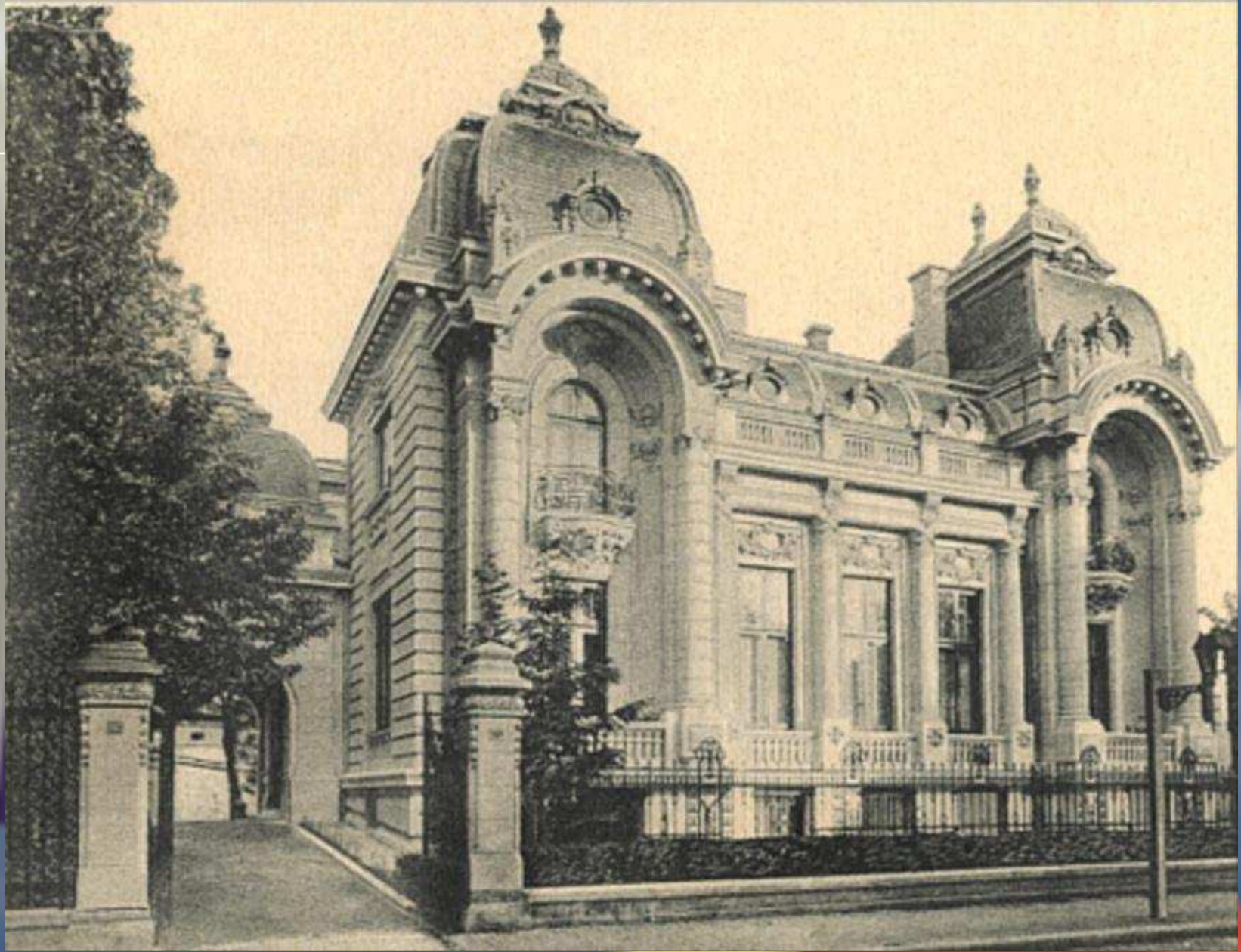
Tony Romani, Slide 3 April 20, 2008