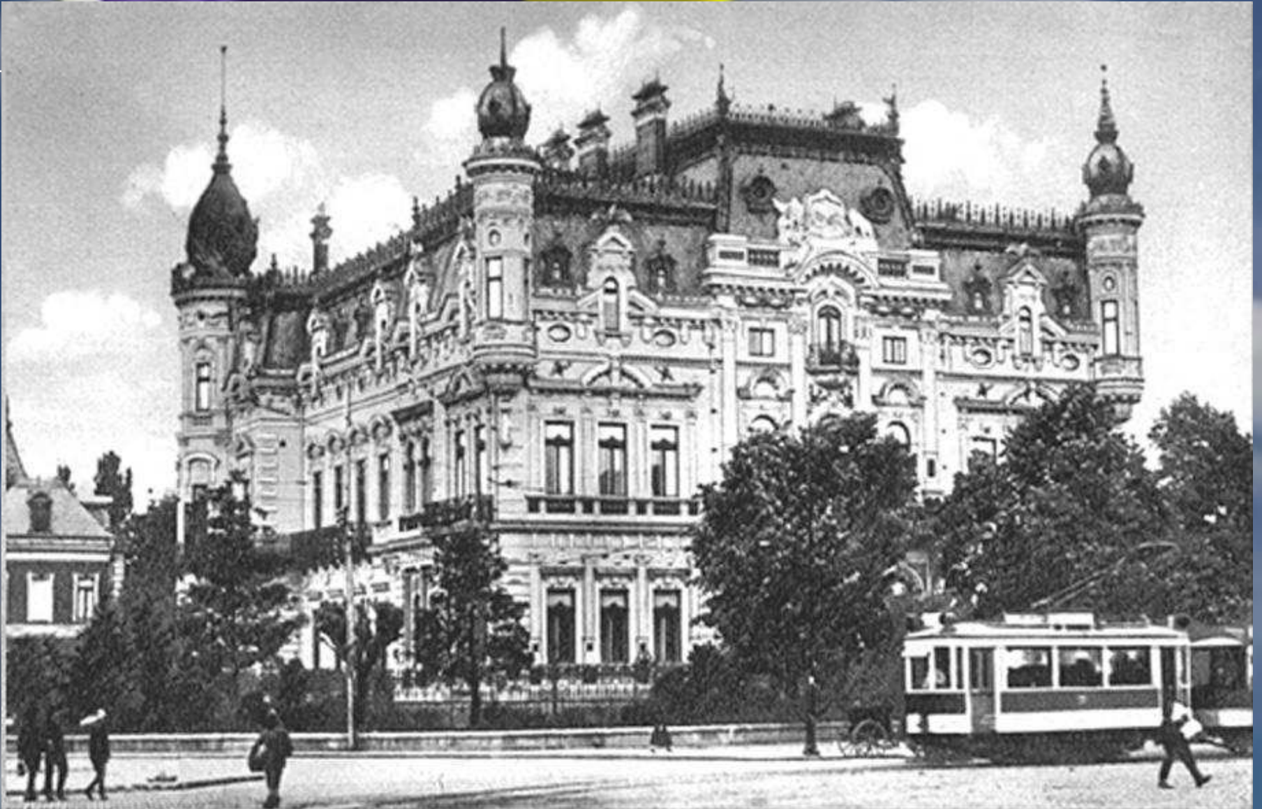
Tony Romani, Slide 6 April 20, 2008