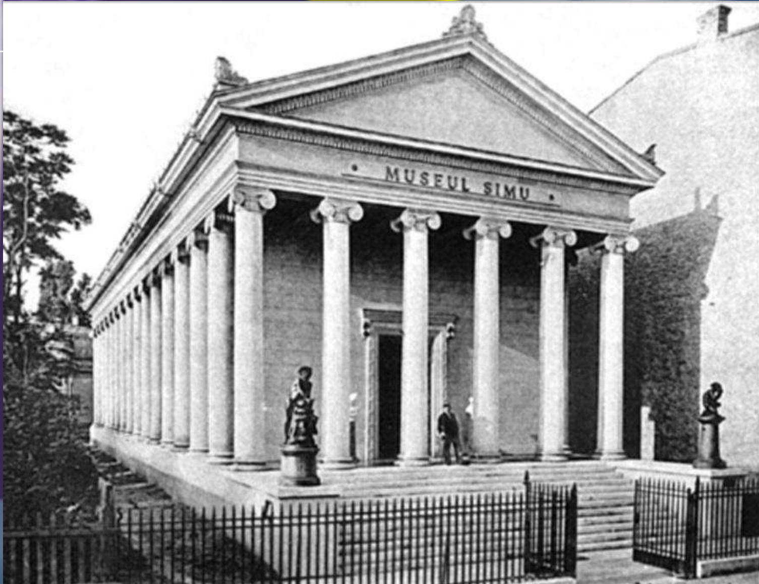
Tony Romani, Slide 5 April 20, 2008