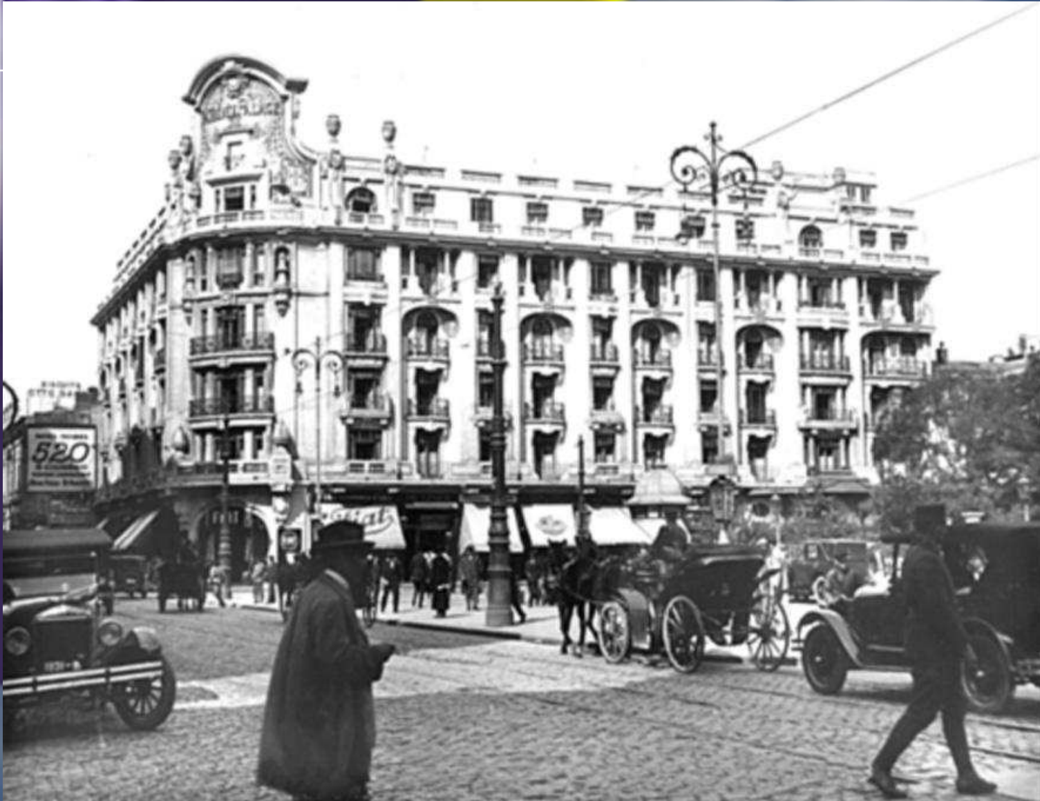
Tony Romani, Slide 4 April 20, 2008