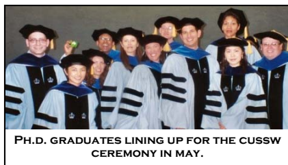
PH.D. GRADUATES LINING UP FOR THE CUSSW CEREMONY IN MAY.