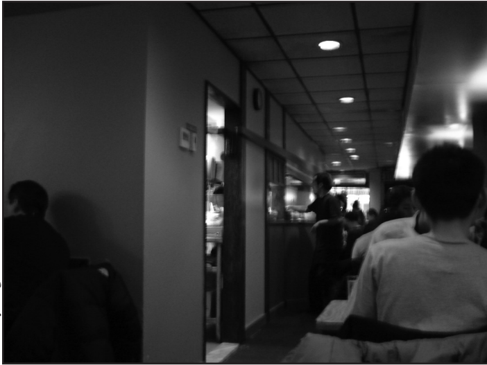
The interior of Menkui Tei is cozy and warmly lit.