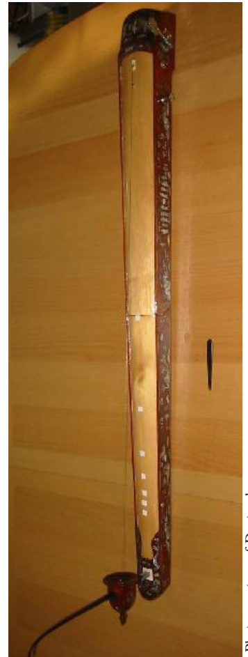
The dan bau, pictured above, is a traditional monochord instrument from Vietnam.