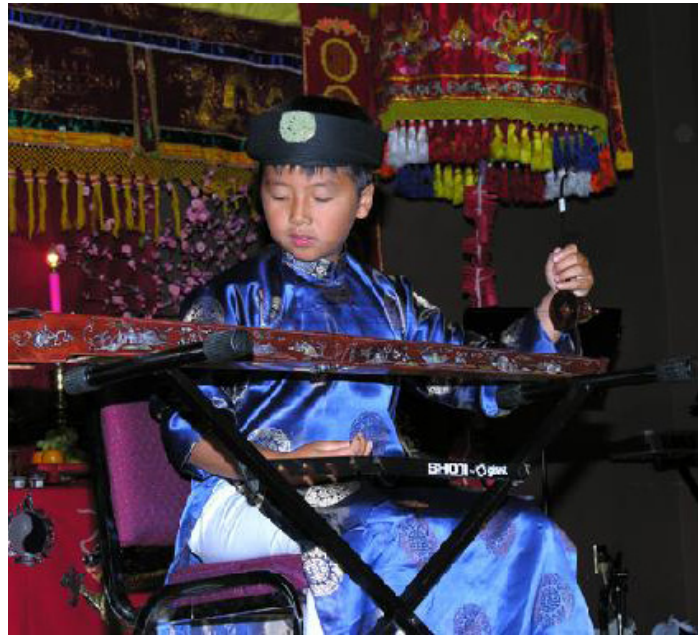
Above, a young performer plays on the dan bau on stage, dressed in traditional garb.