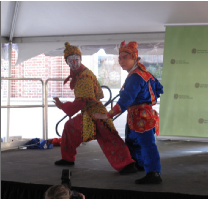
Performers from the Chinese Theater Works group showcased their work on Avery Plaza on Friday, April 30.