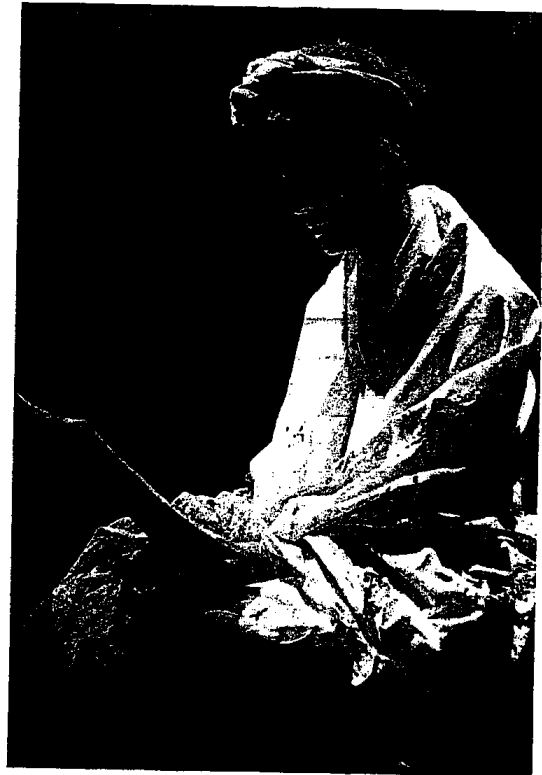
Karen Finley, We Keep Our Victims Ready, 1990, performance at The Kitchen, New York City. Art Matters grant recipient, 1987, 1988, 1990, 1992.