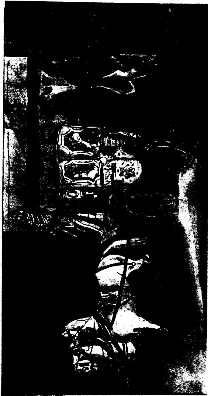
8. Guys: The Sultan's Wives in their Carriage . Pen and water-colour. Paris, Musée des Arts Décoratifs.