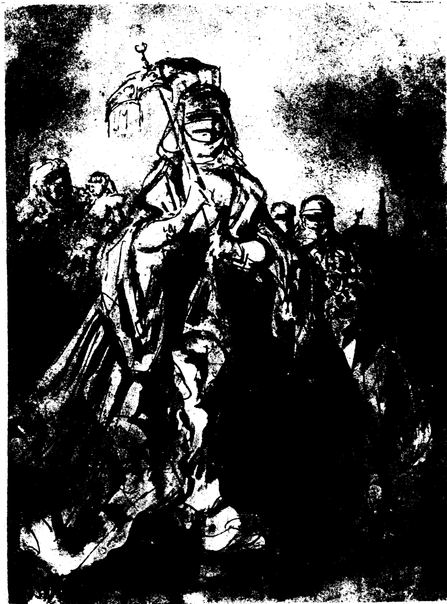
9. Guys: A Turkish Woman with Parasol . Pen and water-colour. Paris, Petit Palais.