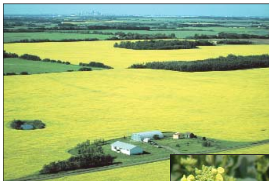
In the air. Pollen from canola flowers (right) moved up to 3 kilometers between fields.

Over the last decade, a handful of small experiments has indicated that a minuscule amount of pollen from engineered crops can spread up to a few hundred meters. But what happens on real farms was unclear. To find