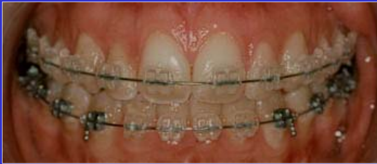
Ceramic/Plastic Straight Wire Brackets