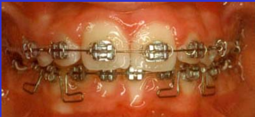
Edgewise brackets bonded on teeth