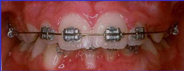
Edgewise Brackets Bonded on Teeth