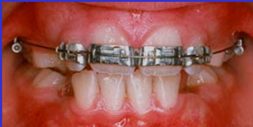
Edgewise brackets welded on bands