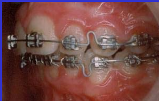
Canine & Premolar Brackets