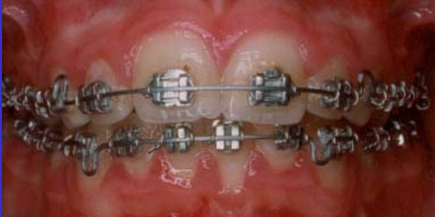
Edgewise Brackets Bonded on Teeth Rectangular TMA Arch wire