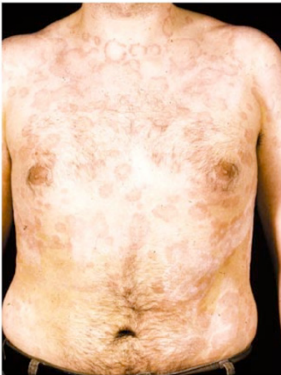
Fig. 1. Urticarial rash in patient following ingestion of penicillin.

He had a past history of angina and cardiac catheterization revealed advanced atherosclerosis. 1 He had no history of allergic rhinitis (hay fever), asthma, or atopic dermatitis. He had received penicillin 4 or 5 times in the past for respiratory infections without any adverse reaction until the last time during which time he noted a rash consistent with urticaria (hives), which resolved spontaneously (Fig. 1). The day prior to admission he awoke with a sore throat and fever. On the morning of admission he was brought by his wife to his family physician. After examining him he prescribed an injection of a "penicillin." This was administered by the office nurse. The patient immediately left the office with his wife and started walking home. About 10-15 minutes later, he began to feel weak and became diaphoretic. 1 He complained of difficulty breathing and chest pain and slid to the ground. His wife hailed a passing taxi and brought him to the emergency room in a trip lasting less than 10 minutes.