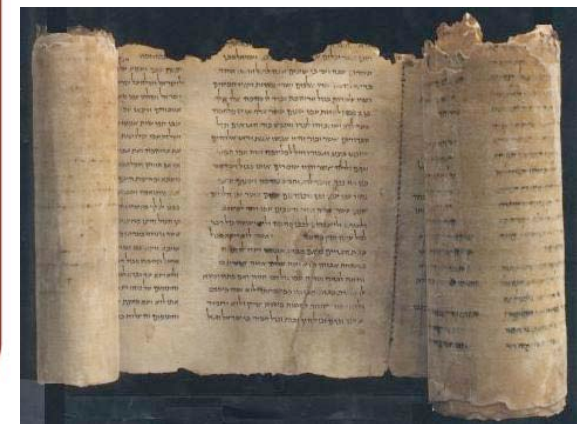
Dead Sea Scrolls

Which parasites do you think they meant??