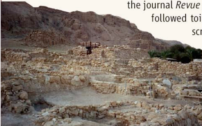
Alleged latrine is behind rocks at upper left.