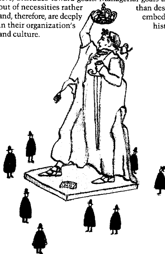
Another conception of leadership attaches mystical beliefs to what a leader is.

Managers tend to adopt impersonal, if not passive, attitudes toward goals. Managerial goals arise out of necessities rather than desires and, therefore, are deeply embedded in their organization's history and culture.