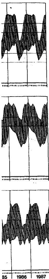
ported to National April, 1985.