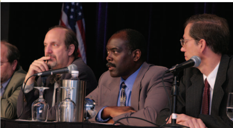
Experts engaged participants each day