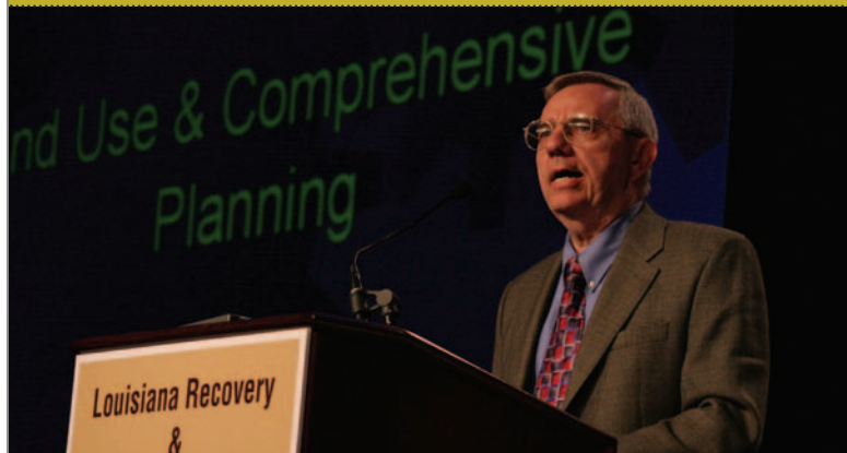
Regional planning stressed