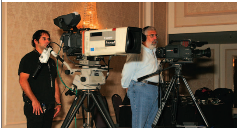
Strong media presence carried the message far and wide

We hope that, from this starting point, all future planning efforts will be dedicated to building consensus through inclusive, participatory dialogue and action. We also hope that the spirit of transparency that characterized the deliberations of the Louisiana