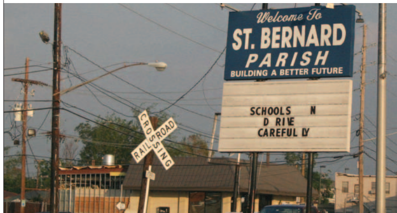
Regional cooperation and planning were emphasized throughout for the better future

"This conference brought people together in the same room who hadn't been talking. It got things moving. It gave us valuable ideas. It underscored the need for sound planning. It came at a time we desperately needed hope and confidence."