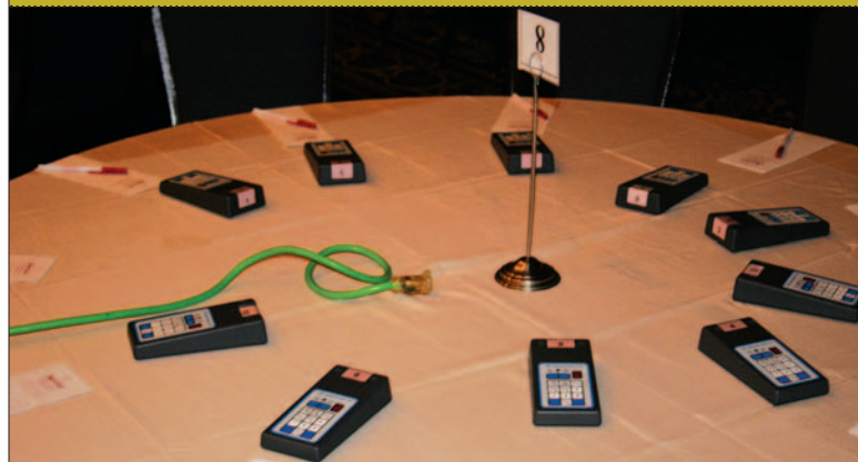
Participants shared their input through discussion and electronic polling