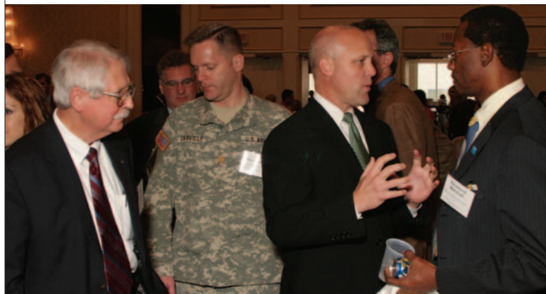
Constructive dialogue took place all conference long

Educate community on the benefits of smart-growth principles.