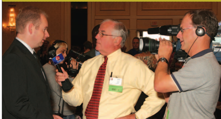
Transparent, open, interactive