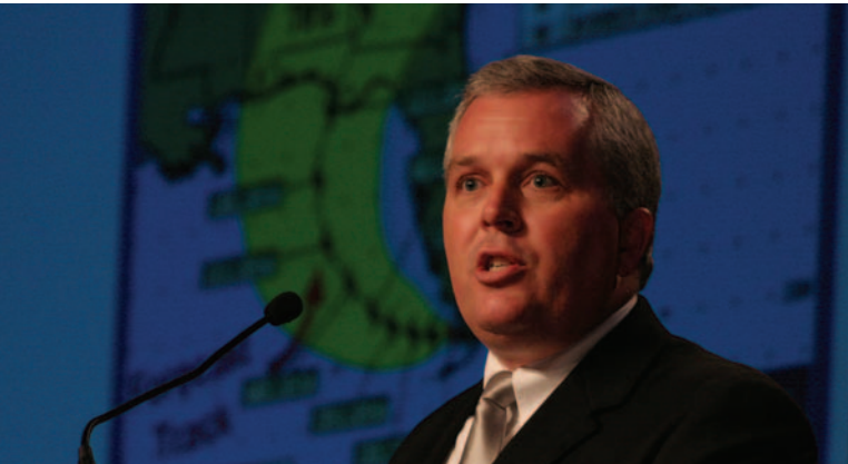
Presenters addressed a broad range of issues