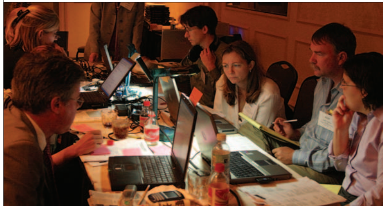
Theme Team worked throughout the conference

— PRESIDENT GEORGE W. BUSH IN JACKSON SQUARE, SEPTEMBER 15, 2005