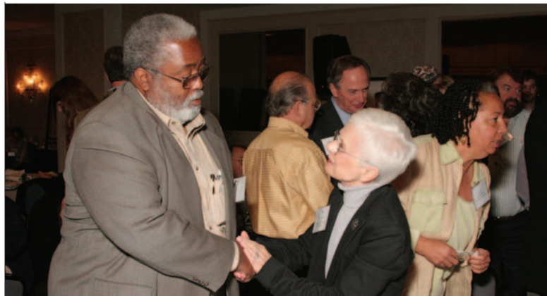
Participants exchanged ideas throughout the conference