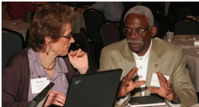
Participants collaborate on goals

UNIFY: Public officials, civic leaders, and citizens of Louisiana must speak with one voice, especially when presenting their case to Congress and the