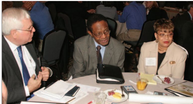
Table discussion, robust interaction

STARTING POINT Southern Coastal Parishes, Baton Rouge/Florida Parishes & Central/Northern Parishes