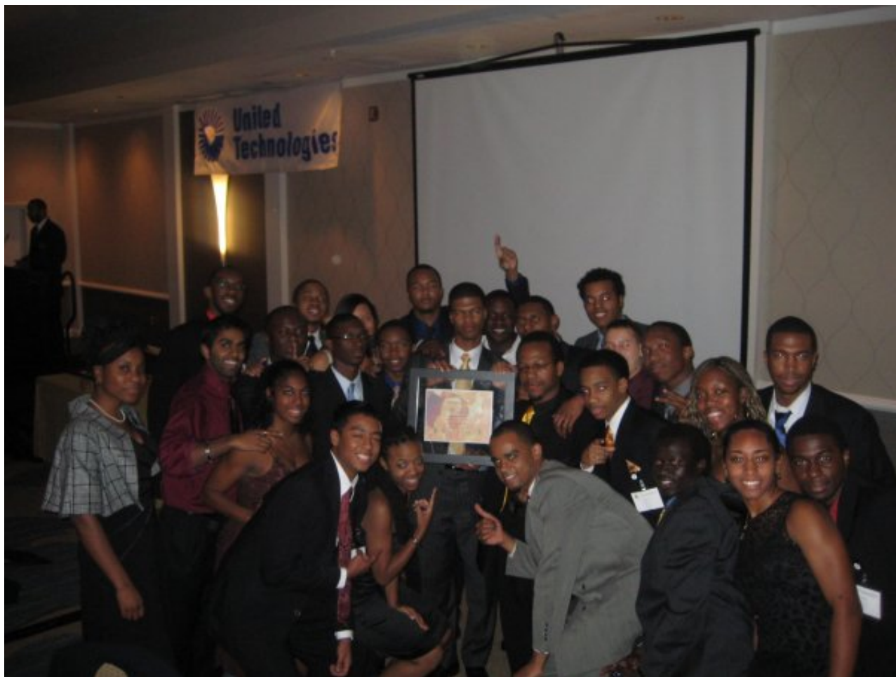
Above: Columbia NSBE Chapter awarded Region 1 Chapter of the Semester at the 2008 Region 1 Fall Regional Conference, November 2008