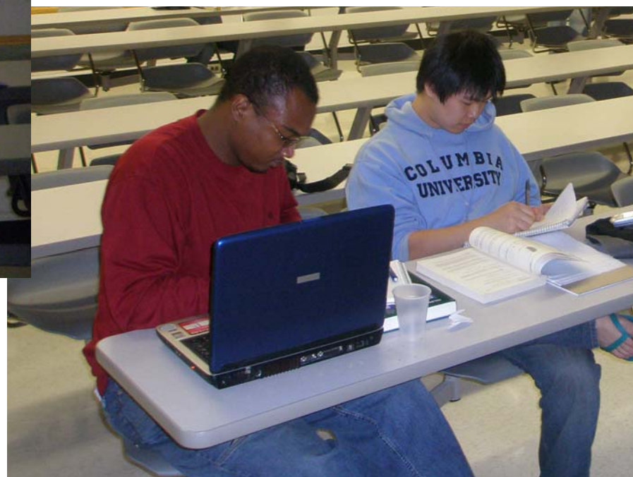
Right: A Columbia NSBE member helps one of his classmates with his homework