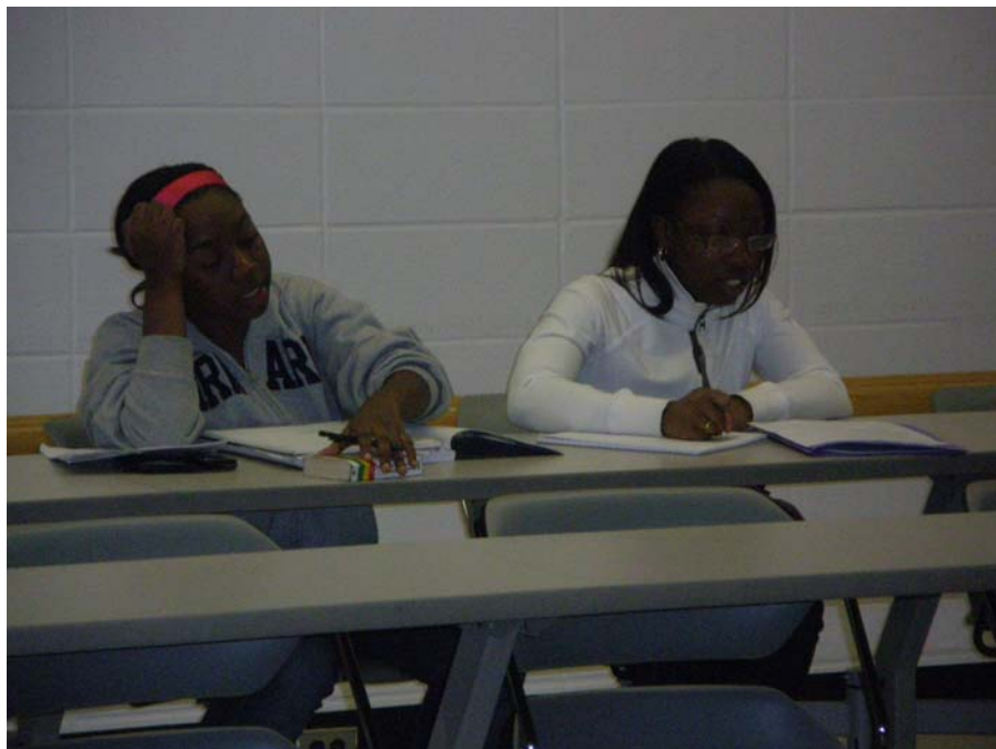
Left: 2 NSBE members study together at one of our Chapter's weekly study sessions