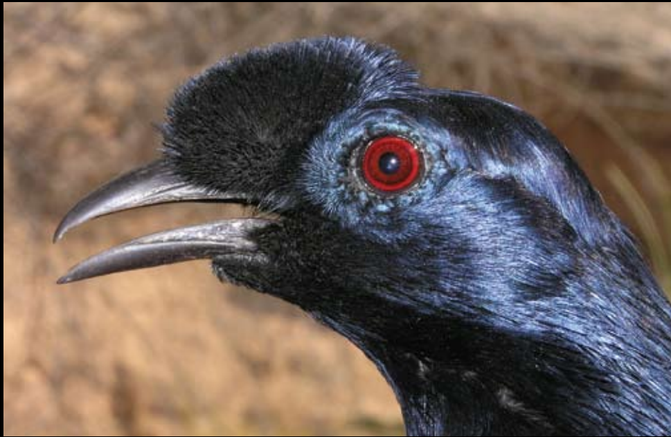
One of the author's research subjects, a bristle-crowned starling.

Much of my work involves traveling to exotic locales to study strange creatures like Galapagos marine iguanas, African starlings, or sponge-dwelling shrimp in the Caribbean. Sometimes my life seems