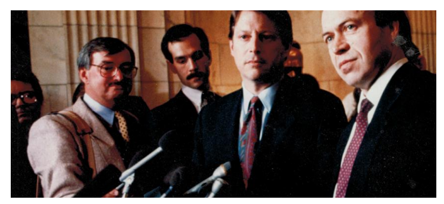
Fig. 29.2. Impromptu news conference outside Senate hearing room.

Later I was told that the demonstration probably has the opposite effect. The lay person thinks "the human effect amounts to a tiny light bulb? All the fuss is about that?"