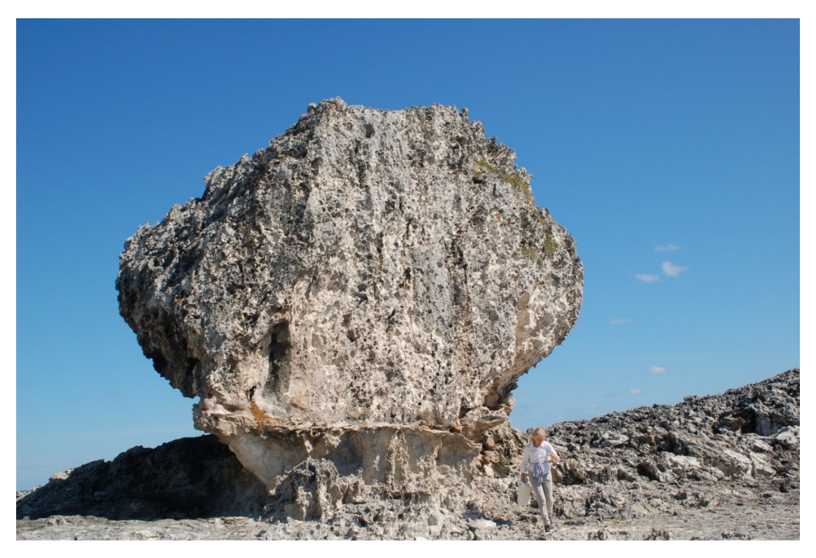
Fig. 1. One of the Hearty boulders, with 1.6 m yardstick walking away from her measuring duty.

Governments, especially the legislative and executive branches, were and are largely under the heavy largesse-laden thumb of the fossil fuel industry. The courts provide a way to pressure the other branches of government, but making an effective case would require more than the "Target CO_2 " paper.<sup>3</sup> The minimum seemed to be better quantification of Earth's energy imbalance and extraction from paleoclimate data of information on the "dangerous" level of human interference with the climate system, and then combining these in a paper<sup>4</sup> intended for a lay audience and legal proceedings. The latter paper required two years from first submission to publication, mainly because an anonymous editorial board member of the Proc. Natl. Acad. Sci. refused to accept a paper that included "normative" statements and defined "dangerous" as a normative word. We finally withdrew the paper and started over with a second journal (PLOS One).