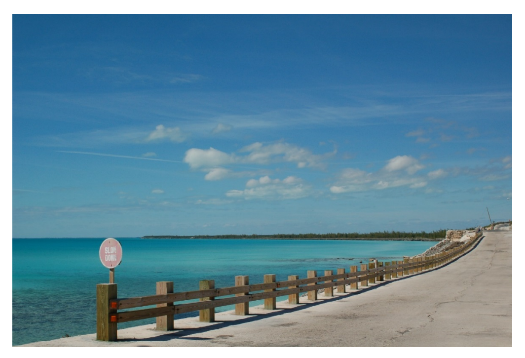
Fig. 3. Looking the other direction, from the road toward the turquoise Caribbean (the bridge and yardstick are at the extreme right)

margin collapse, thus somewhat analogous to a tsunami, or (3) powerful sustained storms from the northeast, with long-period waves that could scour the coastal ocean bottom. None of these three can be ruled out, but parsimony favors #3, because only it can account for the extensive (V-shaped) "chevron" ridges and run-up deposits (see below).