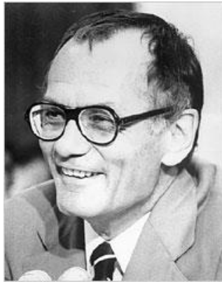
Fig. 11.1. Dr. Robert Jastrow