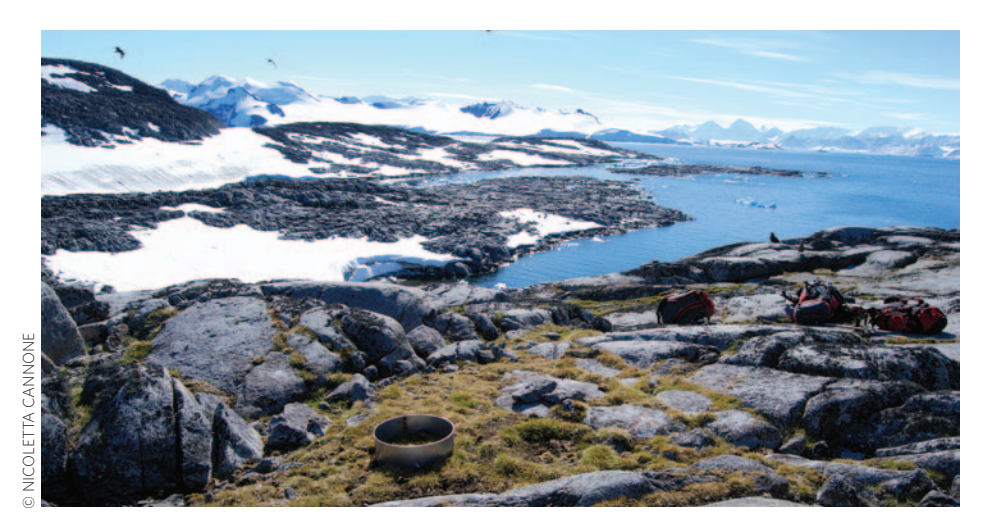
Figure 1 | Monitoring the expansion of flowering plants in the maritime Antarctic. Antarctic hair grass — seen in the foreground of the image, which was taken at Anchorage Island, Marguerite Bay, close to Rothera research station in the Antarctic Peninsula — has expanded rapidly over the past 50 years in maritime Antarctica, out-competing the mosses and other lower plants that dominate the vegetation of these ice-free areas. Hill and co-workers³ show that the grass is able to take up nitrogen in the form of short-chain proteins, which are released during the early stages of decomposition of the protein-rich soils in Antarctica. They propose that this ability gives the species access to a store of nitrogen that is not available to mosses, allowing it to take full advantage of the favourable effect of rising temperatures on photosynthesis in the region.

forms might be the key to explaining the success of Antarctic vascular plants. Using a series of experiments in which they added inorganic forms of nitrogen, amino acids and peptides to soils and plants from Signy (an island off the coast of the Antarctic Peninsula), they explored how Antarctic hair grass acquires nitrogen in the field. Their results provide compelling evidence that the species is able to take up nitrogen as short peptides, and, moreover, that it is able to do so in the presence of microbes, which compete for nitrogen in this form. In fact, the plants acquired nitrogen in this