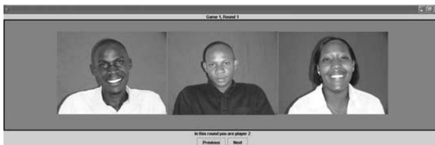
FIGURE 1. Public Information Box with Nonanonymous Offerer

Note: Player 2, the offerer, is “seen” by all players. Note that the images used in this figure are for illustration purposes only and are not the images of actual subjects.