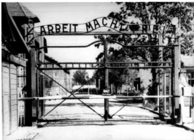
Figure 3. Gate to Auschwitz I

The two gates are the thresholds that represent the difficult access to the narratives of dehumanization and extermination. As Debórah Dwork and Robert Jan van Pelt say of the gate of Auschwitz I, “For the post-Auschwitz generation, that gate symbolizes the threshold that separates the oikomene (the human community) from the planet Auschwitz. It is a fixed point in our collective memory, and therefore the canonical beginning of the tour through the camp. . . . In fact, however, the inscribed arch did not have a central position in the history of Auschwitz.” Most Jewish prisoners, they show, never went through the gate since they were taken by truck directly to Birkenau to be gassed. The expansion of the camp in 1942, moreover, placed the gate in the interior of the camp, not at its threshold. 25