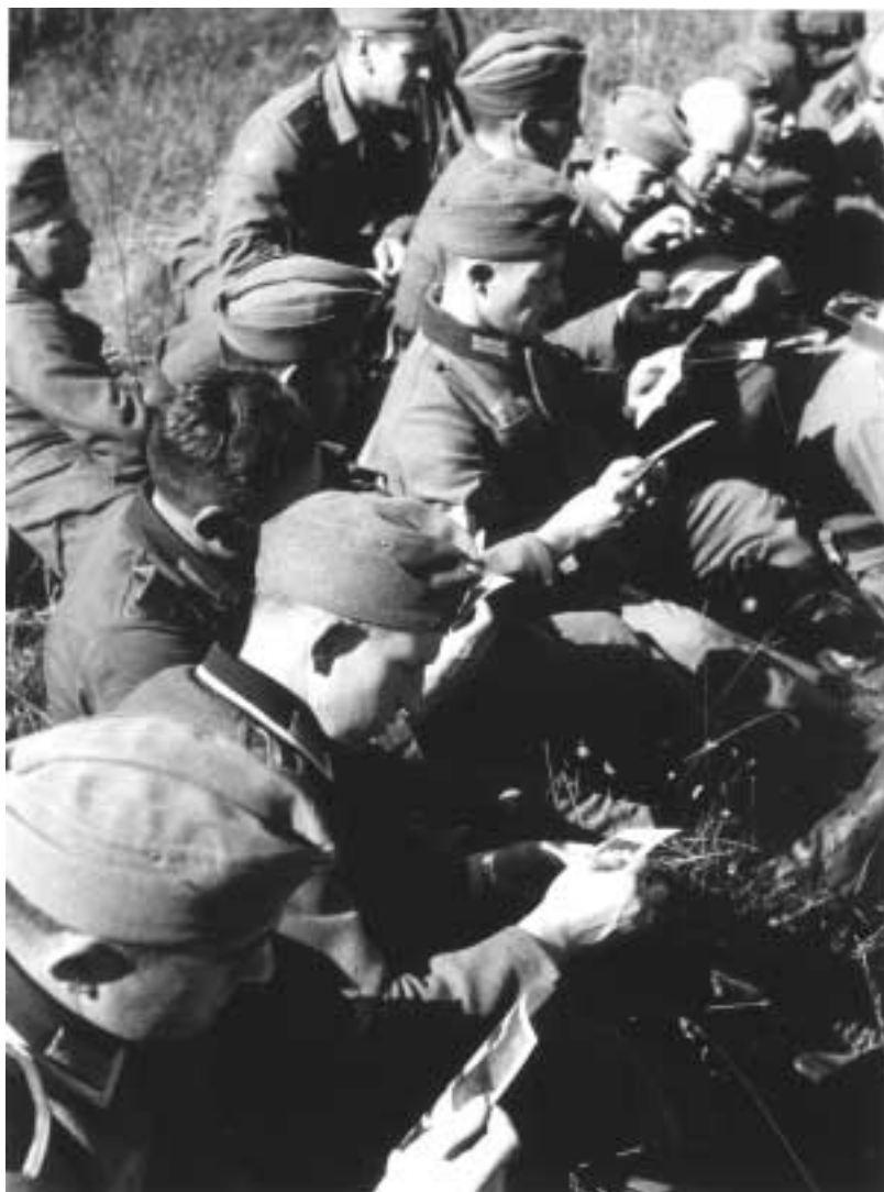
Figure 10. German soldiers examine photographs after executing a group of Jews and Serbs in a reprisal action, Serbia 1941

tographs associated with the Holocaust in particular, the very fact of their existence may be the most astounding, disturbing, incriminating thing about them. Perpetrator images, in particular, are taken by perpetrators for their own consumption. Recently I have come across a set of 38 images that bring this home with shocking force. (See fig. 10.) These are pictures of a reprisal action against Jewish and non-