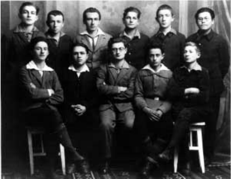
Figure 8. Hashomer Hatzair youth group, Czernowitz/Cernauti, Rumania, 1920s

In order to elaborate on what she calls the photograph's "posthumous irony," Sontag describes Roman Vishniac's pictures of the vanished world of Eastern European Jewish life which are particularly affecting, she argues, because as we look at them we know how soon these people are going to die (70). "Strictly speaking," writes Christian Metz, "the person who has been photographed — . . . is dead. . . . The snapshot, like death, is an instantaneous abduction of the object out of the world into another world, into another kind of time . . . The photographic take is immediate and definitive, like death. . . . Not by chance, the photographic art . . . has been frequently compared with shooting, and the camera with a gun." 29 In the years since Sontag's 1973 book and Metz's 1985 essay, the equation between the camera and the gun, and the concomitant view of the photographic gaze as monolithic and potentially lethal has been significantly qualified as theorists have stressed the multiplicity of looks structuring a photographic image.