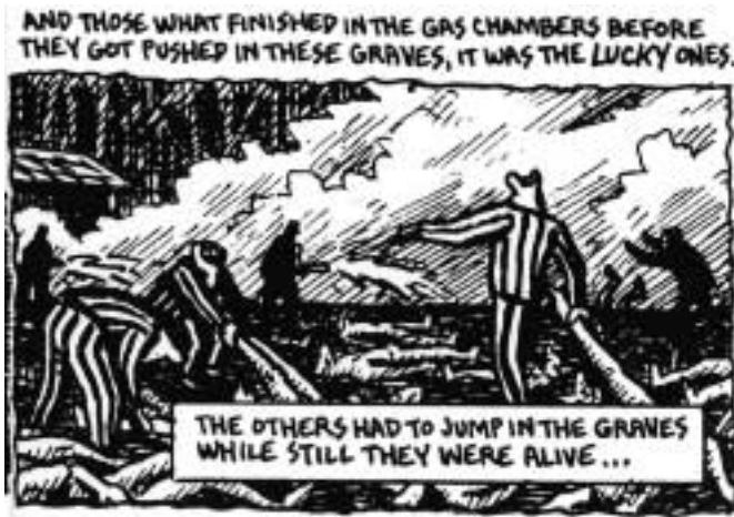
Figure 13. Maus II

into a new graphic idiom he unhinges them from the effects of traumatic repetition, without entirely disabling the functions of sense memory that they contain.