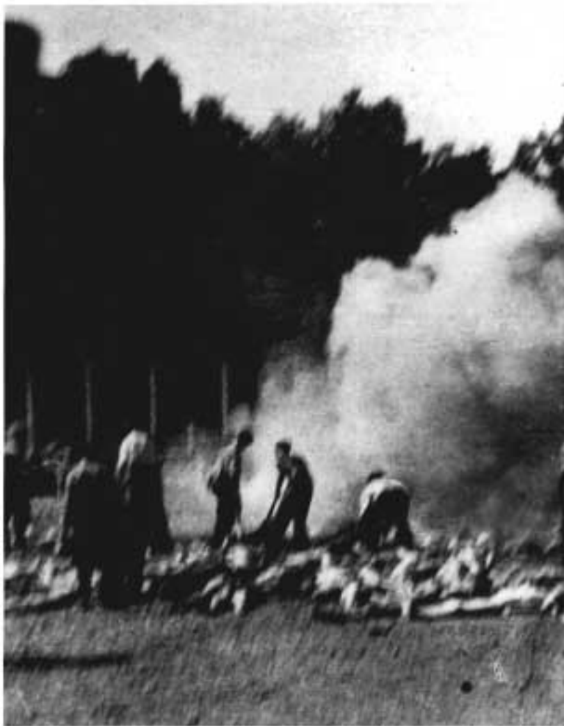
Figure 14. Clandestine image of Sonderkommando forced to burn bodies in Birkenau, Archiwum Państwowego w Oświęcimiu-Brzezince , courtesy of USHMM Photo Archives

domestic and public spaces. Projecting photographs onto trees enables us to see memory as constructed, as cultural rather than natural.