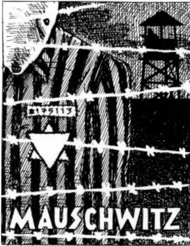
Figure 12. Maus II , courtesy of Art Spiegelman