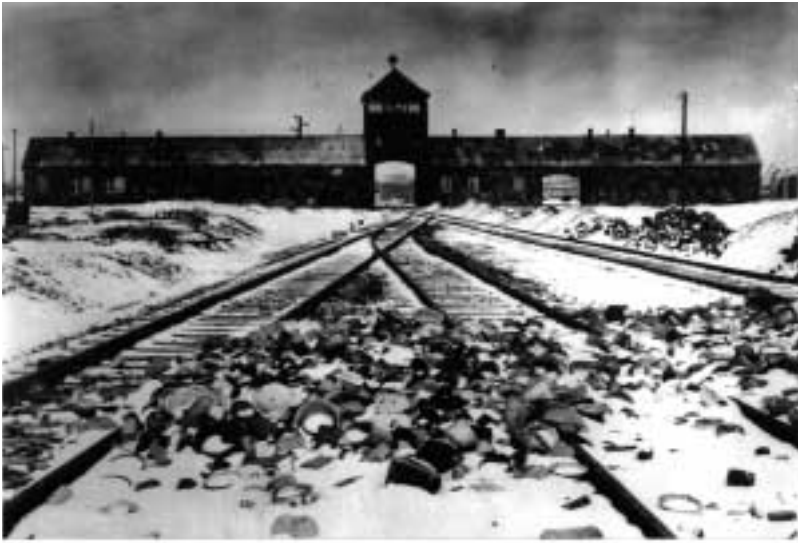
Figure 4. The main rail entrance of Auschwitz -Birkenau just after the liberation of the camp

self, the illusory promise that one could become free if one could only do the work of memory and mourning that would open the gate, allow one to enter back into the past and then, through work, out again into a new freedom? The closed gate would thus be the figure for the ambivalences, the risks of memory and postmemory themselves—“ Halt/ Lebensgefahr .” The obsessively repeated encounter with this picture thus would seem to repeat the lure of remembrance and its deadly dangers—the promise of freedom and its impossibility. At the same time, its emblematic status has made the gate into a screen memory. For instance, Art Spiegelman in Maus draws Vladek’s arrival and departure from Auschwitz through the main gate in 1944/45 when the gate was no longer used as threshold. (See fig. 6 and 7.) For Spiegelman, as for all of us in his generation, the gate is the visual image we share of the arrival in the camp. The artist needs it not only to make the narrative immediate and “authentic”: he needs it as a point of access (a gate) for himself and for his postmemorial readers. 26