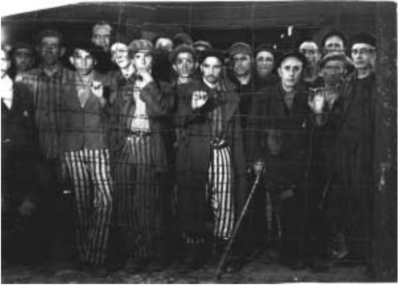
Figure 1. Buchenwald, April 1945.