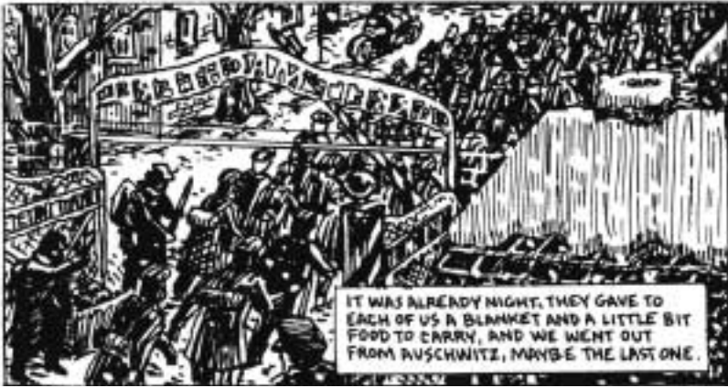
Figure 7. Maus II, courtesy of Art Spiegelman

dozer, perhaps mirror images of one another. In this specific context, one could say that these two machines, worked by humans, do a similar job of burial that represents forgetting; that they recall, however obliquely, another machine—the weapon. And that, when it comes to images of genocidal murder, the postmemorial act of looking performs this unwanted and discomforting mutual implication.