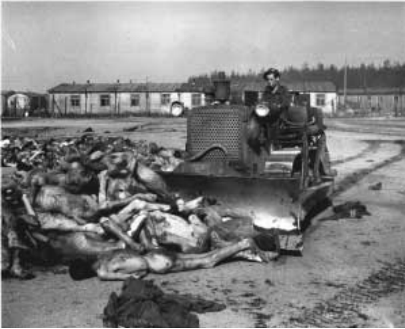
Figure 5. A British soldier clearing corpses at Bergen-Belsen, courtesy of USHMM Photo Archives

looking beyond the fence, inside the gate of death, at death itself. The postmemorial generation, largely limited to these images, replays, obsessively, this oscillation between opening and closing the door to the memory and the experiences of the victims and survivors. 27 The closed gates and the bright lights are also figures for photography, however—for its frustrating flatness, the inability to transcend the limit of its frame, the partial and superficial view, the lack of illumination it offers, leaving the viewer always at a threshold and withholding entrance.