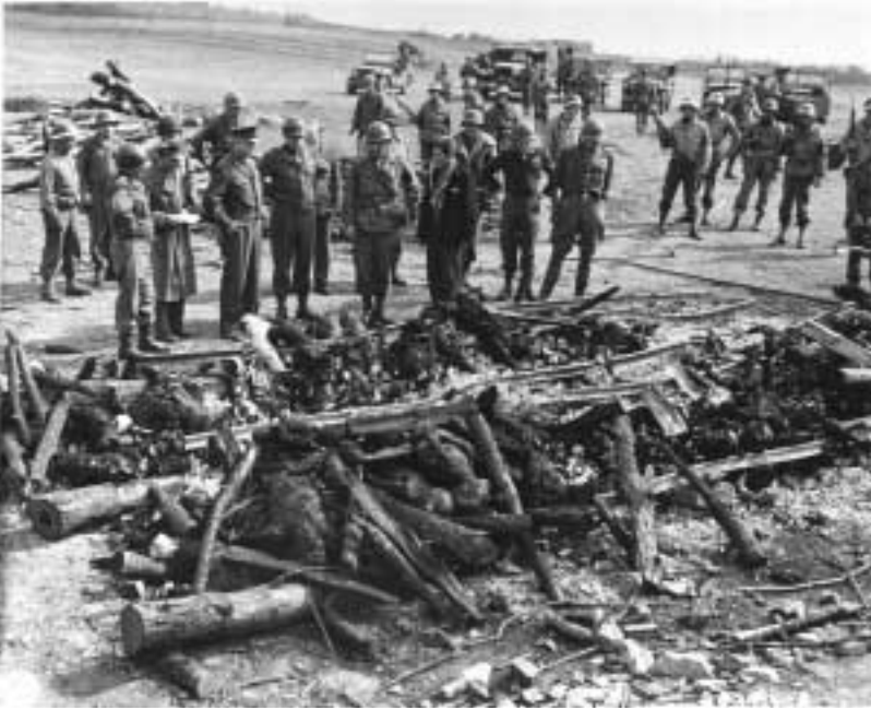
Figure 9. U.S. forces at Ohrdruf Concentration Camp

witnesses and sees both them in the act of looking and what they saw. (See fig. 9.) These multiple and fractured lines of sight among the dead victims, the liberating U.S. army, and the retrospective witness, confirm some recent work that complicates the assumption that a monocular perspective represented by the camera rules the field of vision, as Metz suggests. 30