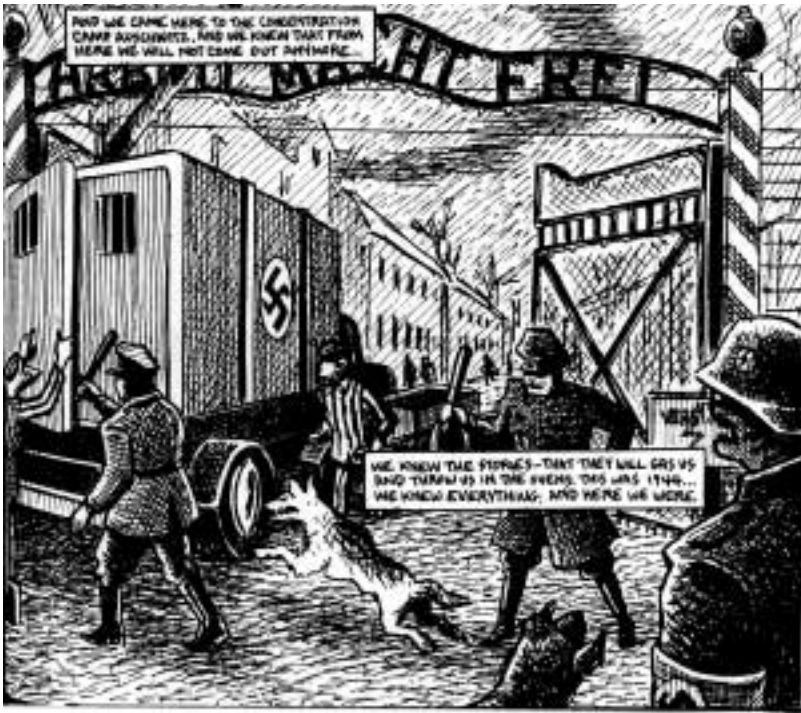
Figure 6. Maus I , courtesy of Art Spiegelman

we come to appreciate the extremity of the outrage and the incomprehension with which they leave anyone who looks. 28