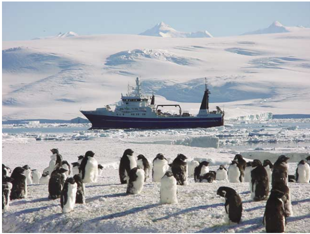
Fig. 3 Antarctic ecosystem with research vessel Tangaroa, New Zealand, in the background.

be augmented or reduced by changes in cloud cover related to climate variability. A summary of nearly a decade of ship and satellite observations along the western Antarctic Peninsula showed a very large (nearly an order of magnitude) interannual variability both spatially and temporally. 156 From the perspective of trying to understand the possible influence of a multitude of environmental factors, such as ozone-related enhanced UV-B, cloud cover and sea ice season, this large interannual variability makes it difficult to attribute cause and effect.