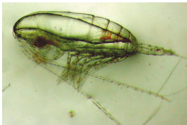
Fig. 2 Photograph of the fifth copepodite of Calanus marshallae Frost.

The copepod Calanus is a key component in marine zooplankton communities in the Gulf of St. Lawrence (Fig. 2). Eggs are released in spring and summer in shallow water and incubate for 1–3 days. At current levels, UV radiation has a negative impact on eggs residing in the first few meters of the water column. 131 Again, variability in cloud cover, water