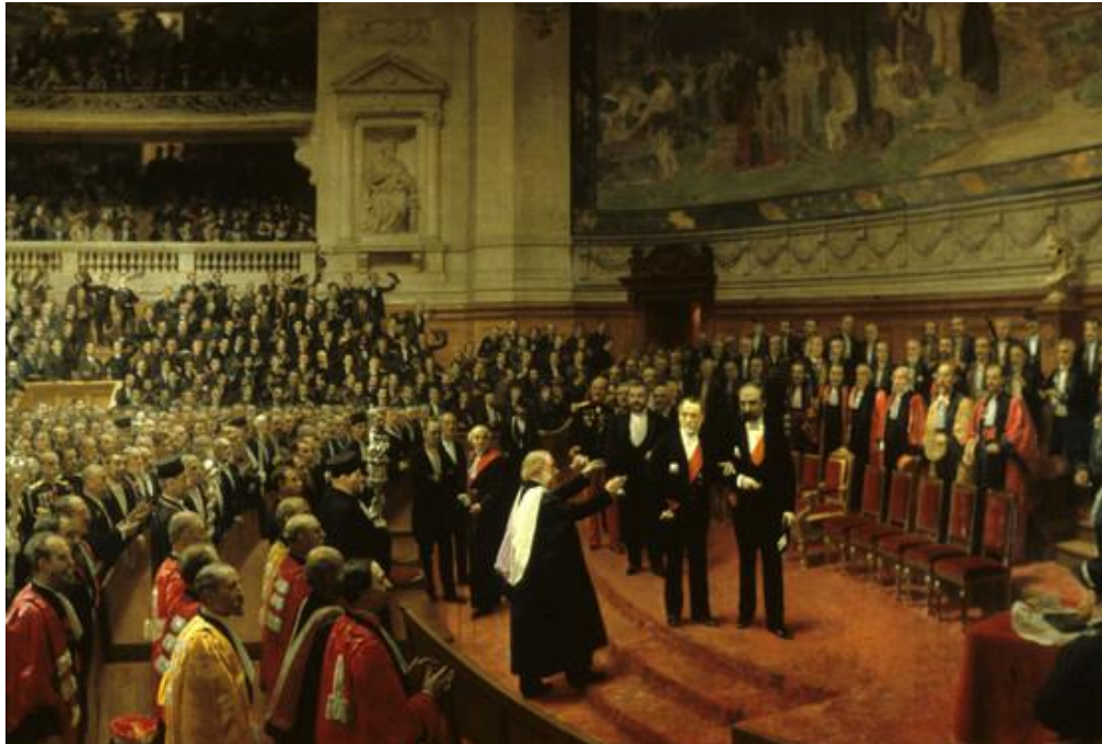
Sorbonne honors Pasteur – 1892

At the cross-roads of tradition and modernity, Paris 1 is at the forefront of research and teaching in the fields of European studies, international relations, management and communications. It aims to be a major pole of research and learning in Europe in the 21st century.