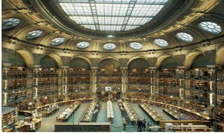
Library of the National Institute for Art History (INHA)